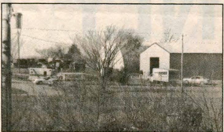
The DEA staked out this former nuclear missile silo in Kansas. The Wamego Times 2000